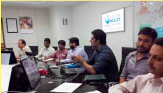
e-Office training of NIELIT officials in progress

The e-Office product aims to support governance by ushering in more effective and transparent inter and intra-government processes. The vision of e-Office is to achieve a simplified, responsive, effective and transparent working of all government offices. NIELIT headquarters has implemented the e-Office product suite of NIC for file management and file movement activities. Hands-on-training has been provided to all officials of NIELIT HQ for the effective implementation of e-Office.