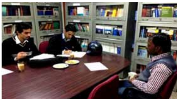
Campus interviews in progress by M/s Tata Business Services

In a step forward in providing opportunity to its students for placements during or after the course, NIELIT Centre Chandigarh has conducted six Campus Placement Drive on its premises during last eleven months. Many reputed companies such as Tata Business Support Services Ltd (TBSSL), Fore Solutions, Research Web Tech, Competent Synergies etc. have conducted interviews of the students of NIELIT Centre Chandigarh. Approximately 160 candidates had appeared for the first round of interview held over a period of one year, in the area of Electronics and IT out of which about 120 candidates have been selected for final round.