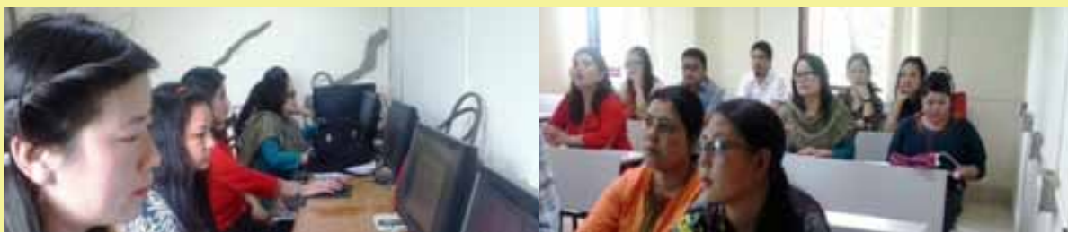
Sikkim Government employees during the training programme