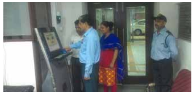
MD, NIELIT and other officials registering their biometric attendance through the touch screen kiosk installed at the reception of NIELIT HQ

The Biometric Attendance and Monitoring System has been commissioned at NIELIT Hq. and NIELIT Centre Delhi since 1.3.14. Under Phase 2, this system is also being introduced at NIELIT Centres at Aurangabad, Gorakhpur, Ajmer, Lucknow, Guwahati & Patna. In Phase 3, remaining Centres shall be covered.