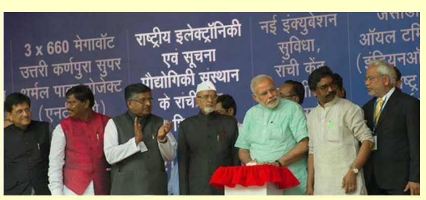
Shri Narendra Modi, Hon'ble Prime Minister, laying the Foundation Stone of NIELIT Centre, Ranchi. Also seen in the picture are Shri Piyush Goyal, Hon'ble Minister of State (I/C) for Power & Coal and New & Renewable Energy, Shri Arjun Munda, former Chief Minister of Jharkhand, Shri Ravi Shankar Prasad, Hon'ble Minister of Communication & IT and Law & Justice, Dr. Syed Ahmed, Hon'ble Governor of Jharkhand, Shri Hemant Soren, Hon'ble Chief Minister of Jharkhand and other dignitaries