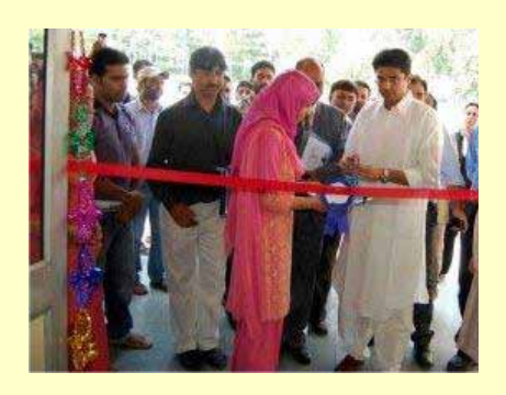
Inauguration of Computer Forensic Lab by Shri Sachin Pilot, Hon'ble Union Minister of State for Communications & Information Technology, Government of India at NIELIT Centre Srinagar

CCC E-Content now available in all recognized Indian Languages (except Santhali) including Mizo and Kokborok