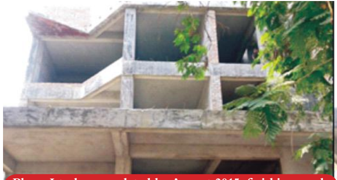
Phase-I to be completed by August 2015, finishing work in progress