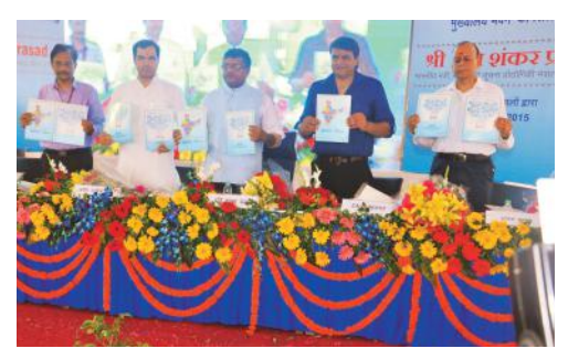
Launch of brochure on Digital Marketing Courses by Shri Ravi Shankar Prasad, Hon'ble Minister of Communications & Information Technology during Foundation Stone Laying Ceremony of NIELIT HQ at Dwarka on May 15, 2015.