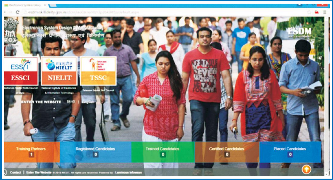
Beta Version of the ESDM Web Portal was soft launched and made operational for functional and load testing by all Stakeholders, including Key Implementing Agencies (KIAs), State Implementing Agencies (SIAs), Training Partners (TPs) PMU officials.

INDIA - POLAND JOINT WORKING GROUP AND 4TH SESSION ON ECONOMIC COOPERATION