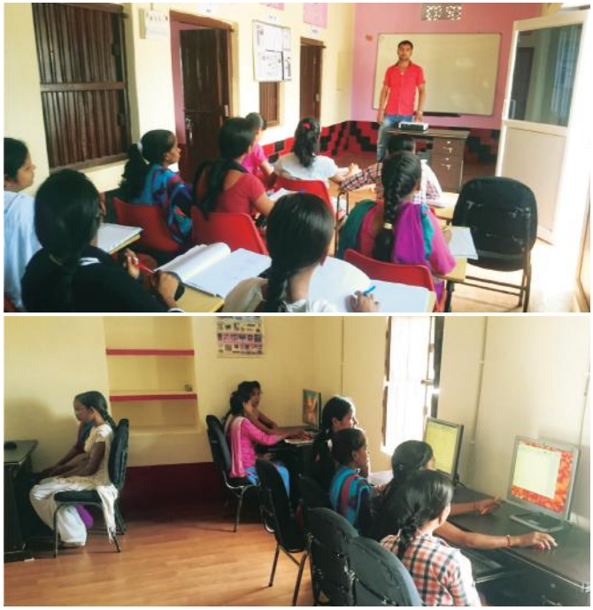
Women from Village Alawalpur undergoing training at Computer Saksharta Kendra, Alawalpur

NIELIT Computer Saksharta Kendra was inaugurated by Shri Ravi Shankar Prasad, Hon'ble Minister of Communications and IT on May 18, 2015. The Computer Saksharta Kendra has been established at a Community Centre in Alawalpur Village, Bihar. The Computer Saksharta Kendra aims to undertake various activities such as, Digital Literacy training program for the local populace under the National Digital Literacy Mission (NDLM) or DISHA (Digital Saksharta Abihyyaan) to support the objective of at least one digitally literate person per family, Capacity Building and Skill Development of Dalits and Mahadalits, Provide citizen services under CSC (Common Service Centre) scheme through a single window concept etc. Villagers, especially adolescent girls and women have shown keen interest in digital Literacy programmes and short term skill oriented programme in IECT of NIELIT.