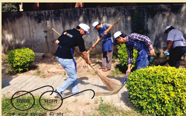
Swacch Bharat Abhiyaan