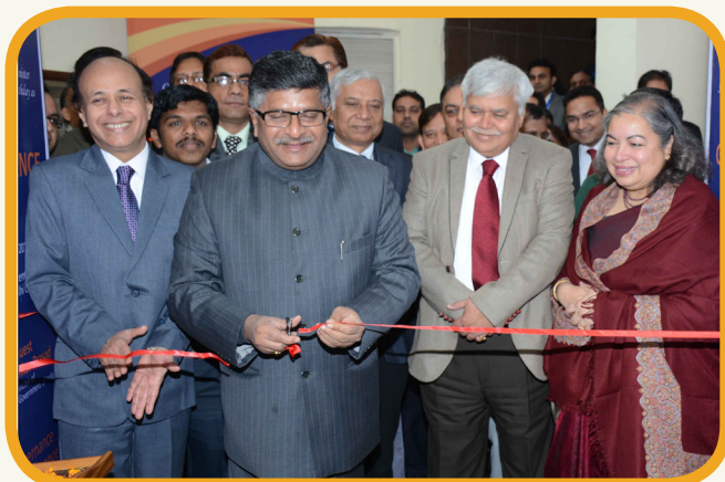
Shri Ravi Shankar Prasad, Hon'ble Minister of Communications and Information Technology inaugurating the "Good Governance" Exhibition