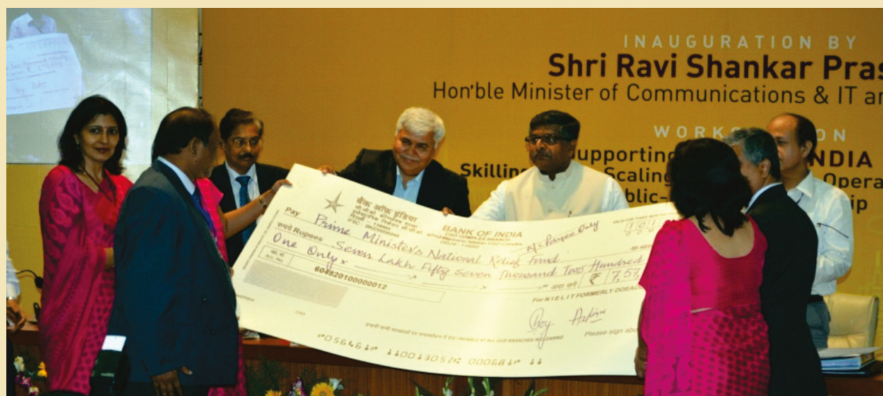
Presentation of Cheque for Rs. 7,57,291/- to Prime Minister's Relief Fund in solidarity with victims of devastating floods in Kashmir