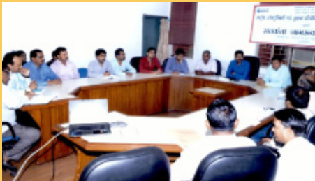
Meeting for Vigilance Awareness is in progress