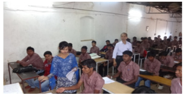
Training session for the rural youth in progress

In order to enhance the employability of Rural Youth, NIELIT Kolkata has successfully conducted a Training program to improve the employability of the Rural Youth belonging to SC/ST & Minority and Women in Jharkhand and Odisha. Around 17000 candidates have been trained in nine SC/ST & Minority populated districts of each state. The candidates have been selected through the State Government Employment officials for training in IT related courses, Electronics Equipment Repair & Maintenance courses and ITES-BPO Courses. | JAYANTA CHAKRABORTY