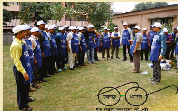
एक कदम स्वच्छता की ओर