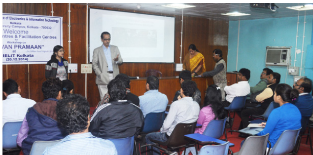
Workshop at NIELIT Kolkata on Jeevan Pramaan

Jeevan Pramaan Scheme seeks to ease the verification of pensioners so that they do not need to run from one office to another in order to get their pensions. The idea is to make the whole process trouble-free for retired government employees. It uses the Aadhaar platform for biometric authentication of the pensioner. NIELIT has been entrusted with the job of enrolling pensioners for their Digital Life Certificate because of its reach and Pan-India presence. A web portal http://nielit.gov.in/JeevanPramaan has been developed which provides information about the nearest NIELIT centres, Accredited Centres and Facilitation centres based on the location of the pensioners. All the facilitation and accreditation centres have been provided with biometric devices (7026 nos.) for facilitating the registration process.