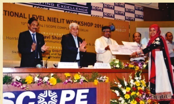
Award to Meritorious Students from rural areas

SCHOLARSHIP FOR WOMEN & SC/ST STUDENTS 7144 CANDIDATES AWARDED SCHOLARSHIP FOR TOTAL OF RS. 2.41 CR. GIRLS HOSTEL AT AURANGABAD THROUGH INTERNAL ACCRUALS