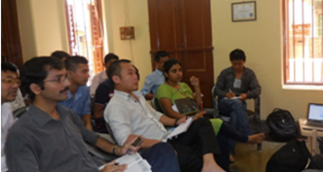
Training Program on Handset Repair and Maintenance in progress

A 10 days Master Trainer Training Program was organized from 18-27 September 2014 at Provider's Skill Academy (P) Ltd., an affiliated Training center of Telecom Sector Skill Council (TSSC), Kolkata. The purpose of this training program was familiarization with mobile handset equipment, different level of Handset Repair and Maintenance, and troubleshooting. The training program was based on the Telecom Sector Skill Council prescribed syllabus level – II. The training programme was attended by officials from NIELIT Center Kolkata, Kohima, Aizawl, Imphal, Shillong, Itanagar and Agartala. Various topics such as introduction to Basic Electronics; Mobile Communication & Telecommunication, familiarization with different parts of Handset, introduction to Android OS, practical on Hardware & Software (FLASHING) etc. were covered in the training. | JAYANTA CHAKRABORTY