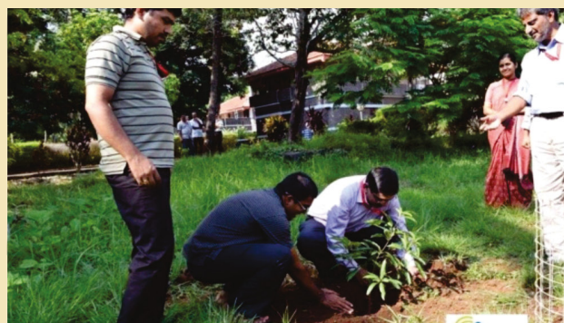
Tree Plantation Programme