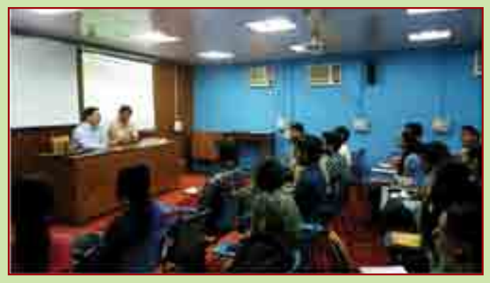
The 7th Batch of the course on "GST Training" commenced on 2nd June, 2018 at NIELIT Kolkata. The Centre is preparing 'a list of GST experts cum Placement Brochure to support others.