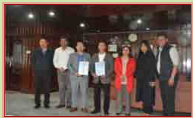
Signing of MoU between NIELIT Kohima and Department of Industries & Commerce, Govt. of Nagaland in the presence of officials from both parties

With the purpose to jointly collaborate for capacity building and skill development inline with the vision of Digital India, MoU between NIELIT Kohima and Department of Industries & Commerce, Govt. of Nagaland was signed on April 18, 2018. As per the MoU, Govt. of Nagaland shall provide build-up space for NIELIT Kohima to set up a centre at Dimapur, the commercial hub of Nagaland for skilling youth in IECT.