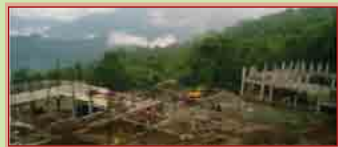
Permanent campus of NIELIT, Gangtok coming up at Pakyong, Sikkim

Construction is in progress for the permanent campus of NIELIT Gangtok centre at Pakyong, Sikkim under the Union Cabinet approved project sponsored by MeitY for upliftment of the Youths of NE States - "Development of NE Region by Enhancing the Training / Education Capacity in IECT Area".