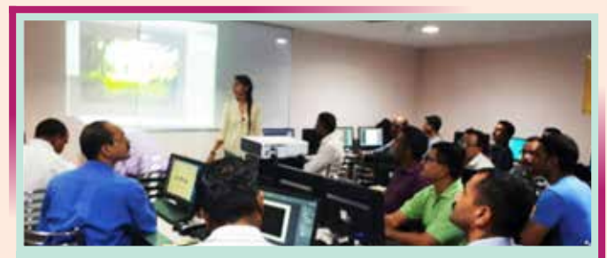
A glimpse of training session