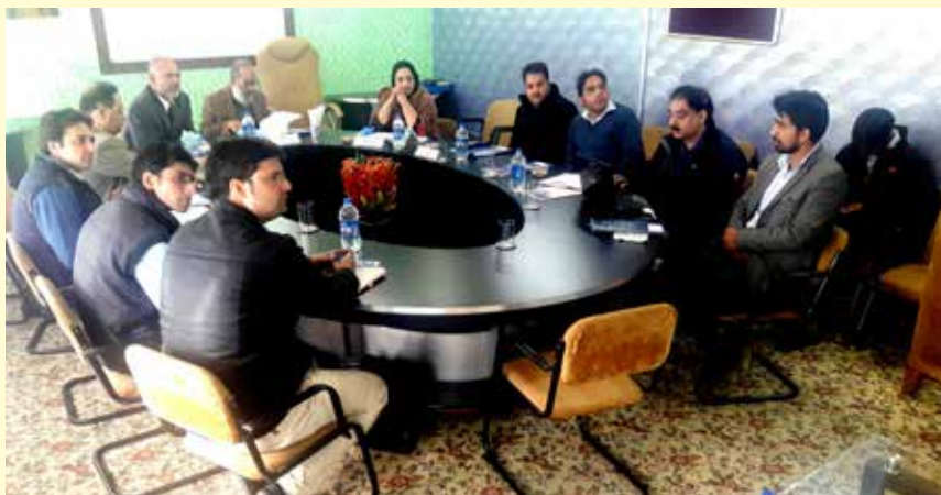
The 27 th Executive Meeting of NIELIT Srinagar in progress