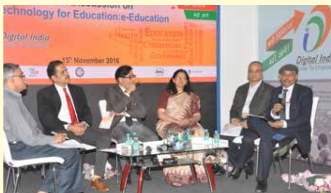
The panel discussion on 'Technology for Education – eEducation' in progress