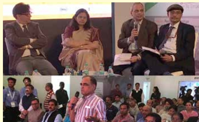
Interactive session with the audience

The event witnessed jam-packed audiences as the panelists provided a meaningful insight into ways and means for scaling up of promising models and the transfer of best practices across markets. It was an informative platform as the session deliberated on use of technology to address skill gap needs, including the creation of learning objectives; development of curricula and instructional strategies; provide appropriate interventions and track outcomes and learning. | SHAMEEM KHAN