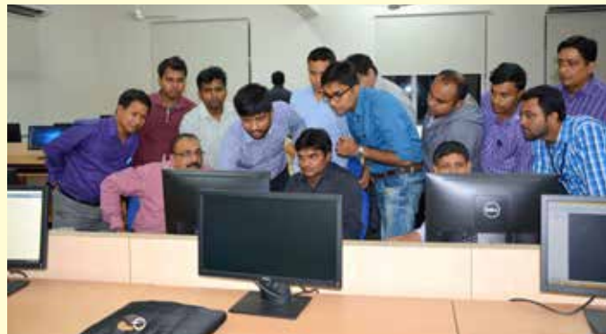
Hands on session in ISEA Awareness in progress

As a part of execution of the project of Information Security Education & Awareness (ISEA) Phase – II, a 2 Days Faculty Development Programme on “Advance Information Security” was conducted by NIELIT Agartala in association with Wissen IT consulting, Kolkata during November 12-13, 2016.