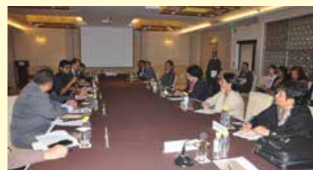
The Academic Advisory Committee deliberated the proposal on Online Assessment & Evaluation System (OAES) for 'O' Level by IIIT, Bangalore.