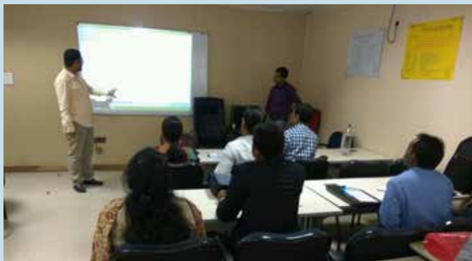
A Training Session on NCS Portal Being Conducted at NIELIT Patna