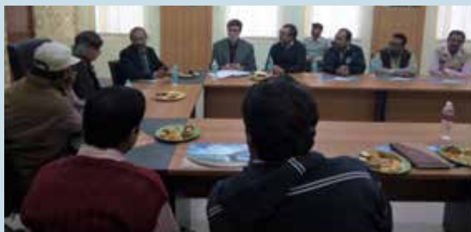
Seen in the picture are Director General, NIELIT in discussion with RCCIIT Chairman among other senior officials of NIELIT and RCCIIT