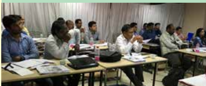
A glimpse of Training of Trainers Session