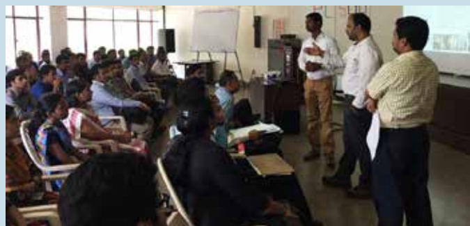
Executives of HCL Technologies interacting with students of NIELIT Calicut