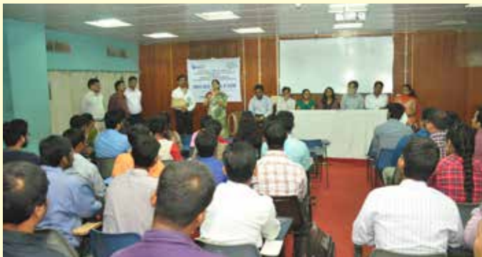
Inaugural session at the job fair

National Career Service (NCS) is the online portal of Government of India for creating a common platform for job seekers, employers along with career counselors, skill providers and placement organizations. NIELIT Kolkata has been identified as a Nodal Centre under the NCS.