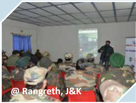
@ Rangreth, J&amp;K