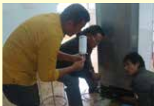
A demonstration on Medical Equipments Maintenance

A five days training on Maintenance of Medical Equipments for in-service paramedical staff, Nagaland was conducted by NIELIT Kohima during October 24-28, 2016. This programme was aimed at imparting knowledge on repair of medical equipments and