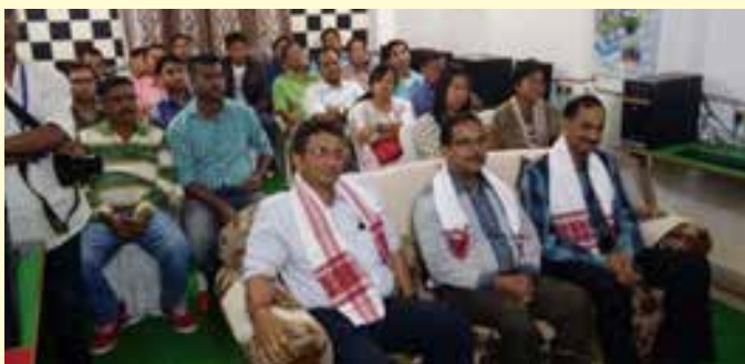
Inauguration of training programme under the scheme 'Preparing North East for Digital India'

Under the 'Digital India', Scheme of Government of India, National e-Governance Division (NeGD), Ministry of Electronics and Information Technology (MeitY) has joined hands with NIELIT to train 16,000 nos of Government Employees of all the North Eastern States in two years. As a part of the special scheme launched by MeitY titled "Preparing North East for Digital India", 4400 No. of Govt. officials are to be trained in NIELIT CCC and CCC+ course in all districts of Assam. NIELIT Guwahati has launched the scheme on November 21, 2016 by starting training of 20 nos. Govt. of Assam employees in CCC Course at Diphu and Karbi Anglong Districts of Assam.