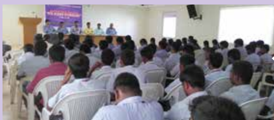
Conduction of Skill Development Course for Polytechnic Students (KSR Poly. College) Under EPDPT Project in Tiruchengode, Tamil Nadu

NIELIT Chennai has conducted short term courses in places like Rajapalyam, Tiruchengode Taluk, Gingee Taluk etc., which are interior villages in the state of Tamil Nadu. Access to modern education, infrastructure and technology is almost nil in these areas. The short term courses offered by NIELIT Chennai are of high practical standards which gave the students an opportunity to perceive the industry and gain practical knowledge. | V. KRISHNAMURTHY