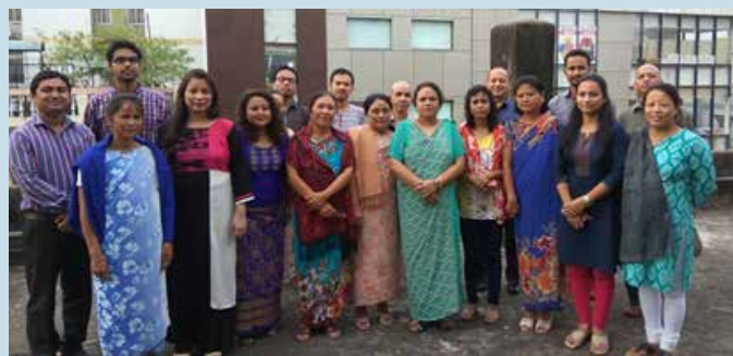
Employment Officers of Meghalaya during the training programme

NIELIT Centre Guwahati has conducted a two day training program on National Career Service Portal ( www.ncsportal.in ) for the Employment Officers of North Eastern Region of India. The first batch of training commenced on October 17, 2016 and till now four batches have been completed. Altogether, 75 Employment Officers from the state of Assam, Meghalaya, Nagaland and Tripura has been trained in four batches.