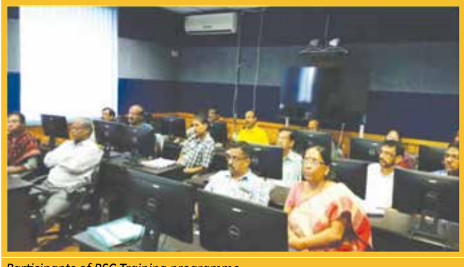
Participants of PSC Training programme

NIELIT Kolkata Centre has organized a 36 hours duration training programme on Office Automation for the officials of Public Service Commission, Govt. of West Bengal during August 2017 where 15 State Govt. officials participated.