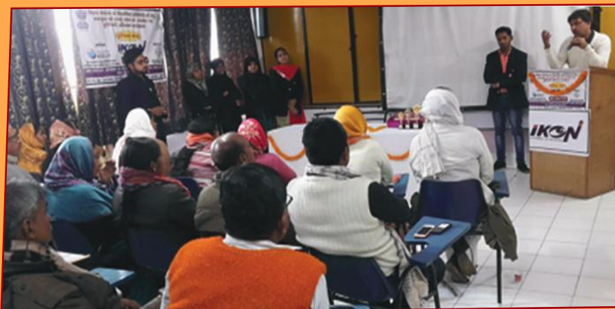
PRI Members (village mukhiyas) attending training session

NIELIT Patna Centre is conducted training of PRI member (village mukhiyas) at 12 districts of Bihar on "Basic Computer Literacy and Use of Smart Phones". The training session was held from 12 th Dec 2017 to 9 th Feb 2018. The Training was mainly organised to give emphasis on to learn the basic uses of computer literacy and uses of smart phones.