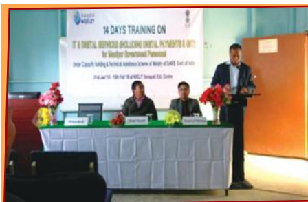
@NIELIT Senapati Extension Centre