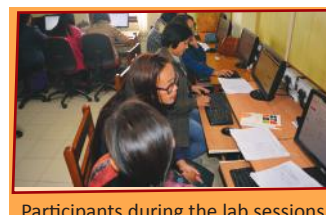
Participants during the lab sessions