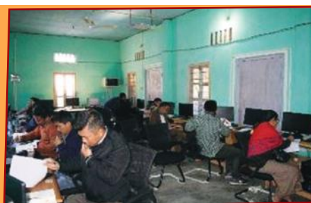
@NIELIT Churachandpur Extension Centre