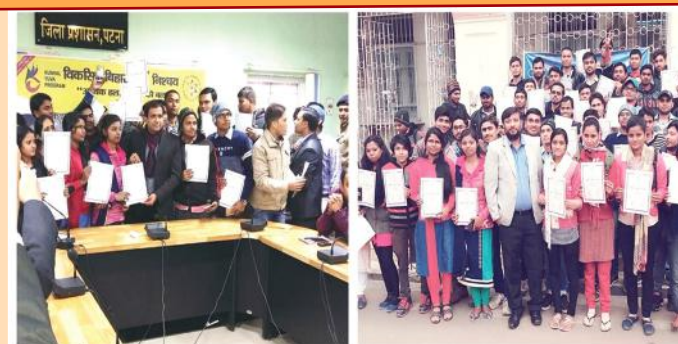
Certificate Distribution by DM Patna to Kushal Yuva Program Passed out students under Bihar Skill Development Mission (BSDM) Project.