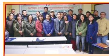
Trainees of the 'e-Waste' Awareness program with the officials of NIELIT Gangtok after completion of the training

NIELIT Gangtok conducted training of Sikkim Government officials towards Capacity Building of Government Employees on 'e-Waste' through 1-3 Day Training Program (Phase-II), under 'Digital India' initiative sponsored by Ministry of Electronics and IT (MeitY), Government of India. The training was initiated on 21 st February 2018 with 25 officials of Government of Sikkim Departments by NIELIT Gangtok at its Gangtok office. The training was inaugurated by Shri Arup Chattopadhyay, Director-in-Charge, NIELIT Gangtok who encouraged the participants to take maximum benefit out of the training and spread awareness about 'e-Waste' and the hazardous impacts of 'e-Waste'. The training was further imparted by Shri Khagendra Sharma, Scientist C, NIELIT Gangtok.