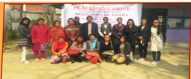
Participants of the placement drive.