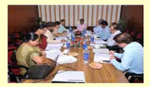
14th Meeting of Executive Committee of NIELIT Centre, Chandigarh held on 15th October, 2012 in progress