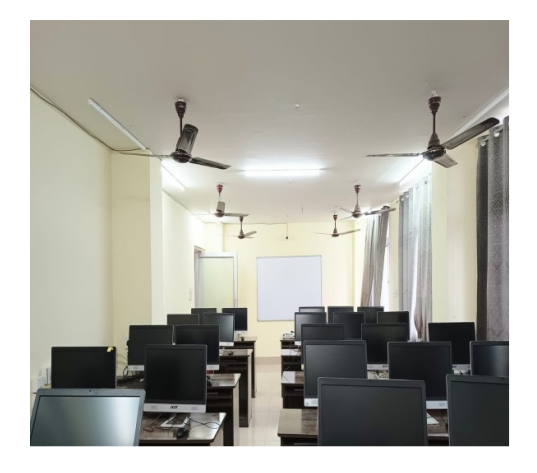
NIELIT\ Dibrugargh\ Extension\ Centre-Computer\ Lab