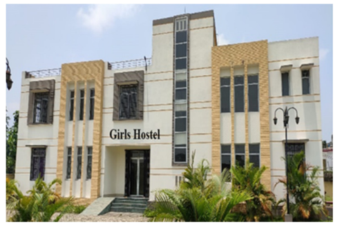
NIELIT Jorhat Extension Centre -Girls' Hostel