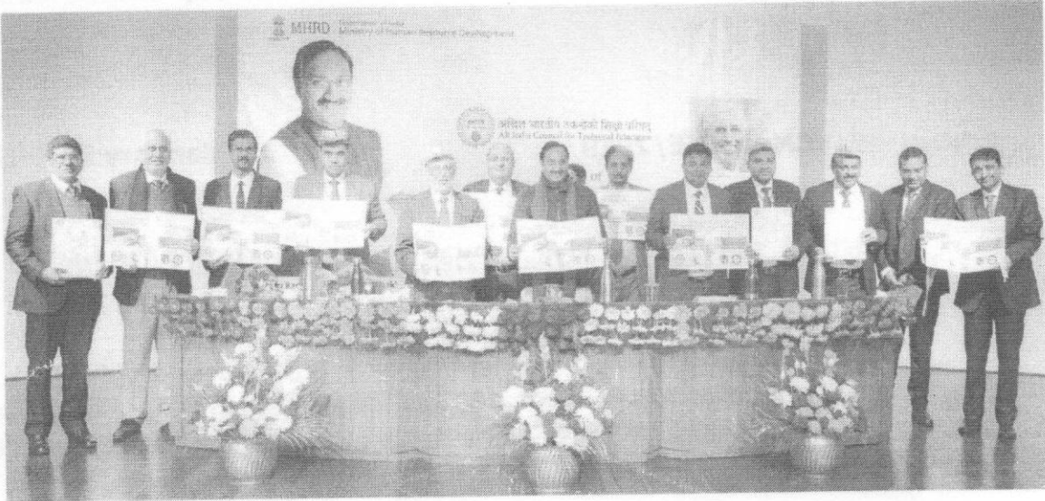
Union Minister of HRD Shri Ramesh Pokhriyal 'Nishank' launching AICTE Initiative: Technical Teachers Training Policy